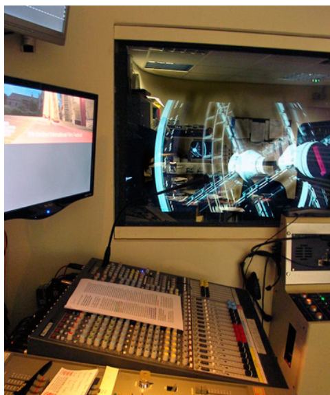
A room with a view – space glimpsed from Bradford's Pictureville projection box.